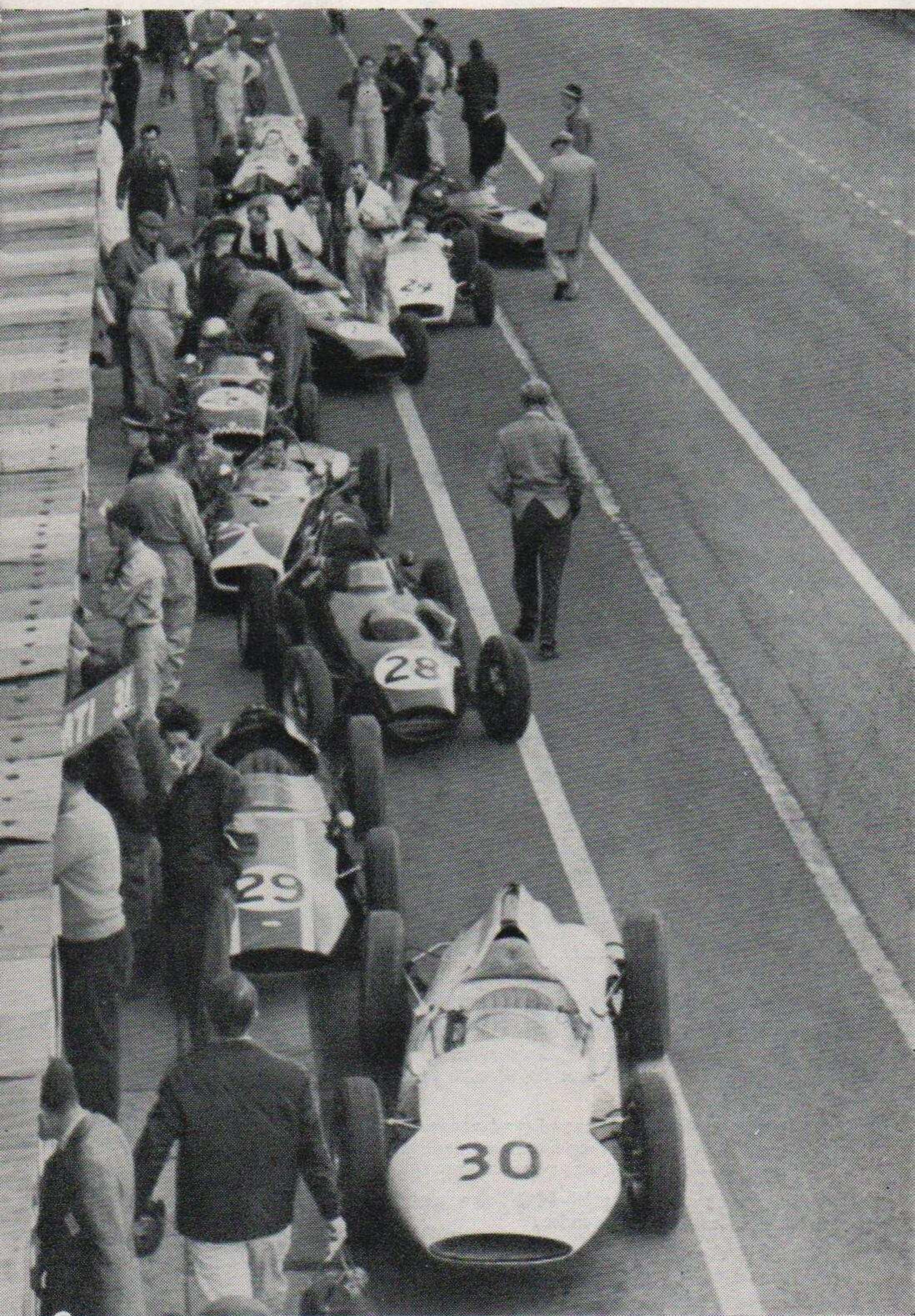
The pits, Aintree '200' 1961