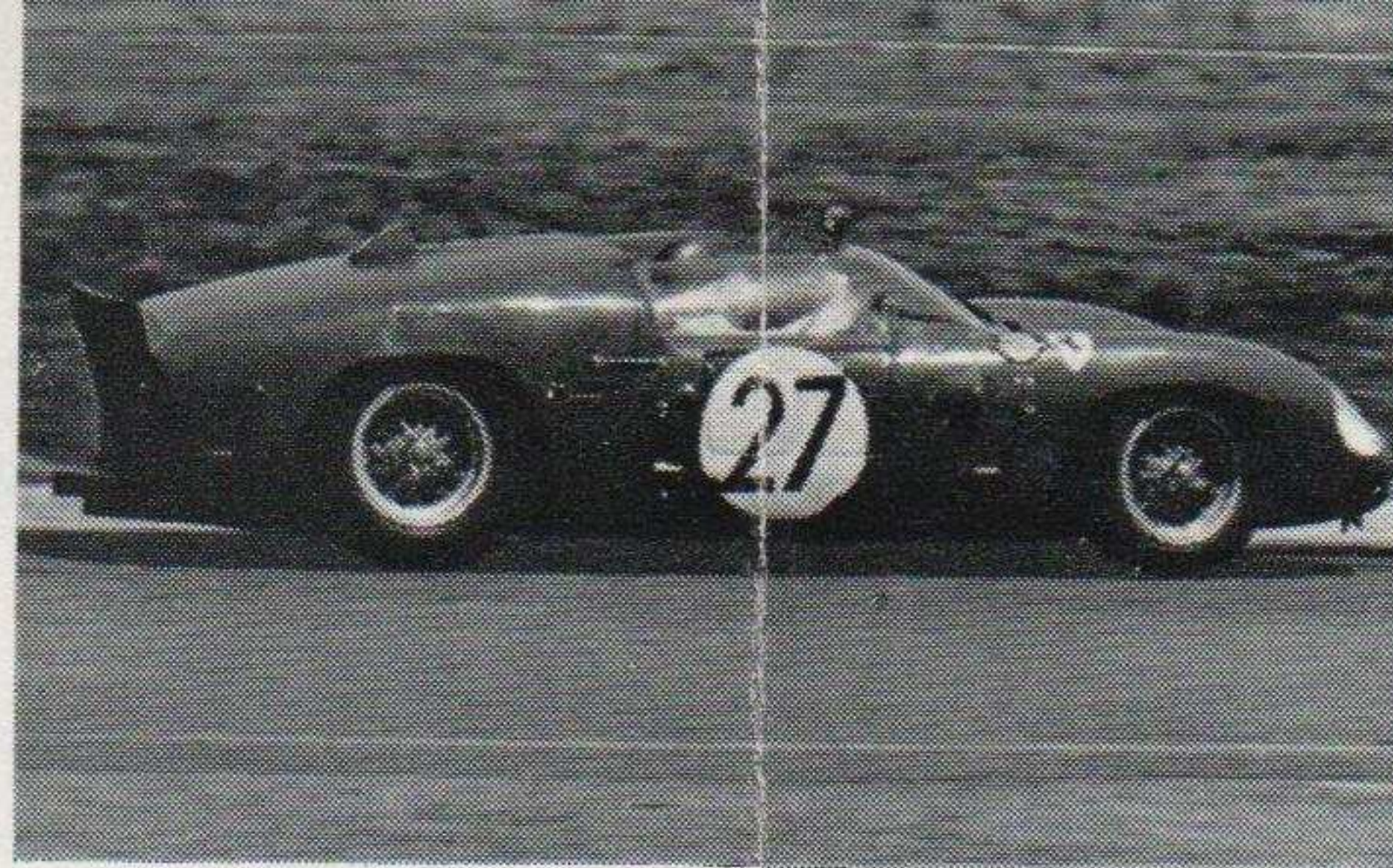
Ritchie Ginther, Ferrari. 1961 (SPORTS CARS)