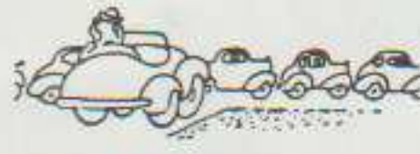
Remember that PATIENCE goes a long way toward safety.