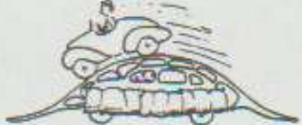
Drive defensively. Assume that the other driver is going to do something foolish.