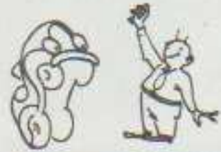
Remember that your vehicle will do as you bid only if you are the master.