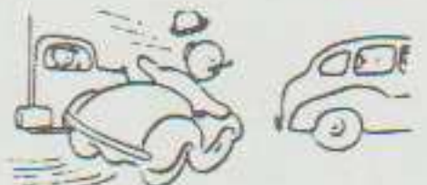
Don't "tailgate"—drive so close that a car passing you can't get back in the left-hand lane.