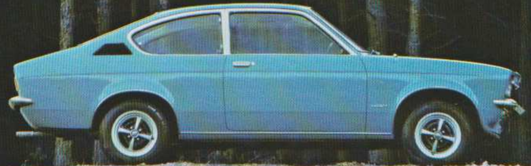
Ascona 1900 SR.