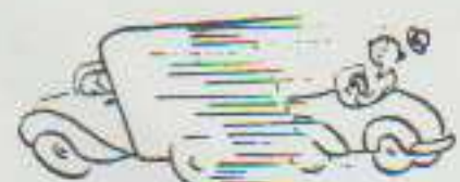
If you drive a truck, don't try to keep the same pace as other vehicles.