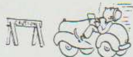
Don't be too lazy to lift your foot from the gas to the brake when you see potential danger.