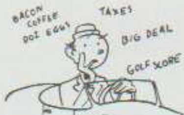
Park all your personal problems at the kerb before driving.