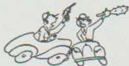
Never debate the right-of-way—give it.