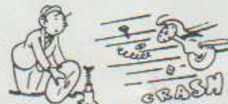
If you must stop on a highway, stop OFF it.