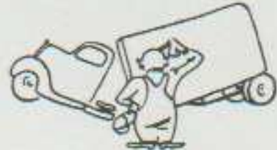
Know the condition of your truck or automobile.