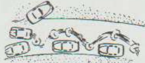
Gear the miles you cover and your driving to existing traffic.