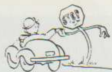
Accept traffic laws as aids.