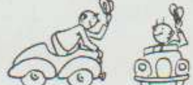
Try to go the second mile in courtesy—remember the three C's of safe driving: care, courtesy and common sense.