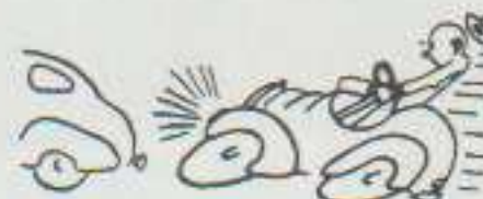
Don't "overdrive" your lights and brakes.