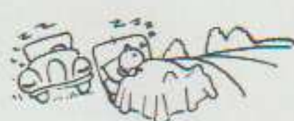
Never fight sleep AT the wheel—surrender to it OFF the road.