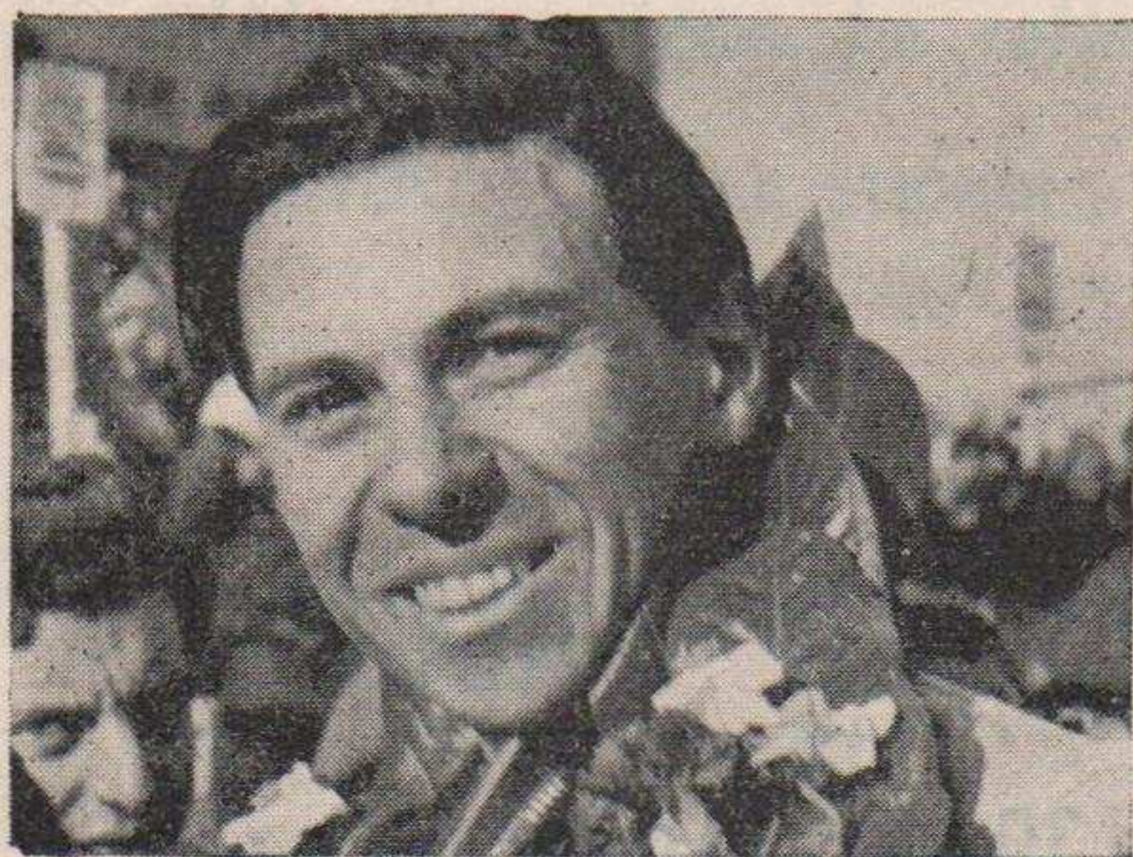
JIM CLARK DRIVING F.1. LOTUS