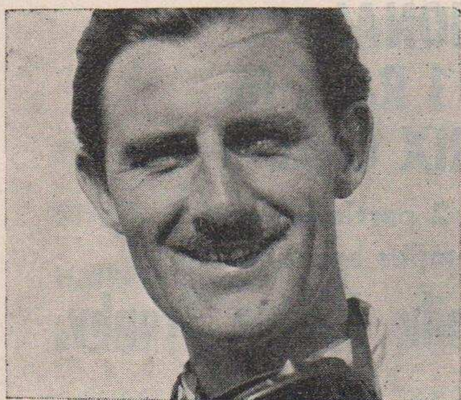
GRAHAM HILL DRIVING B.R.M.